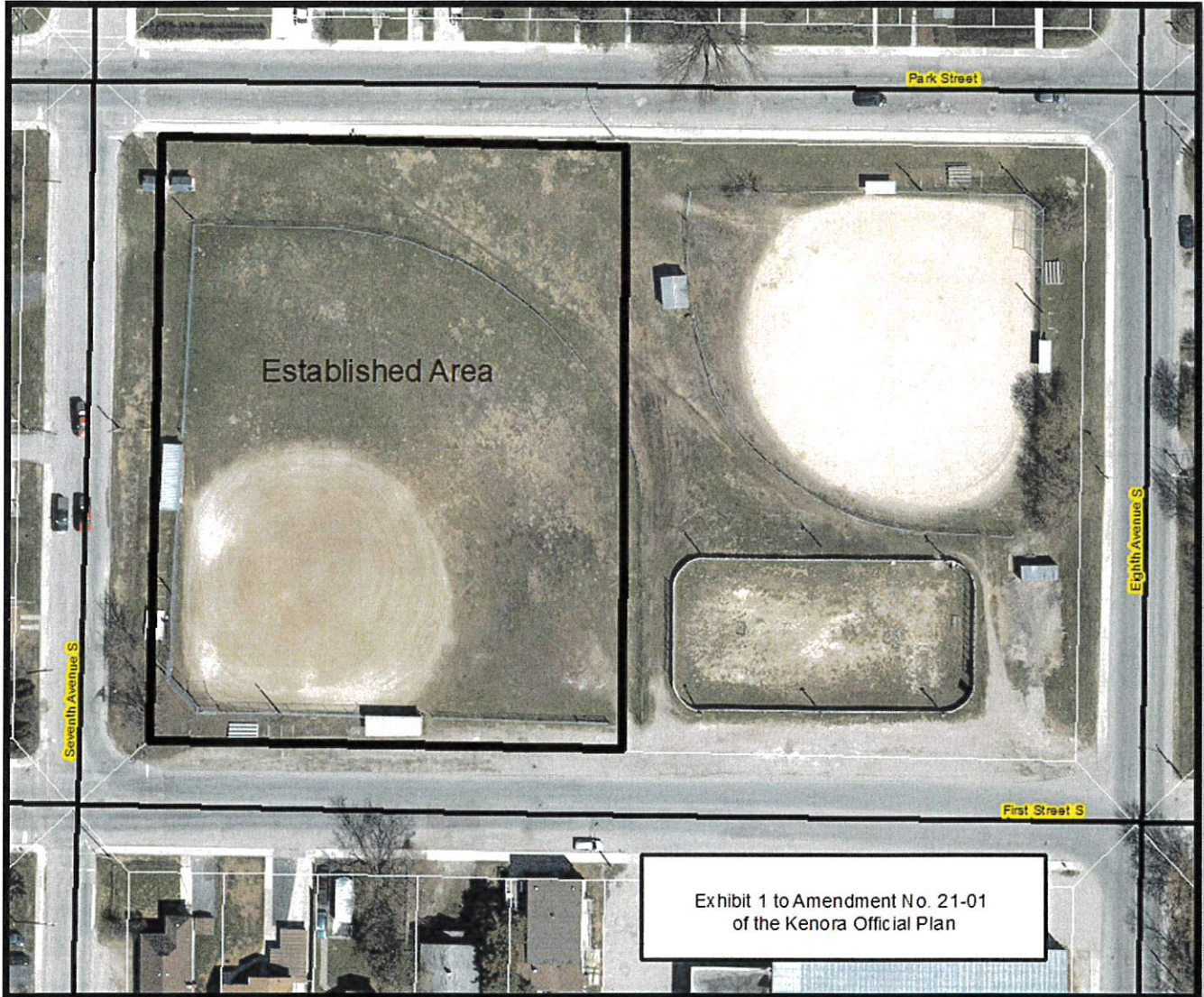
EXHIBIT 1 TO AMENDMENT NO. 21-01 OF THE KENORA OFFICIAL PLAN